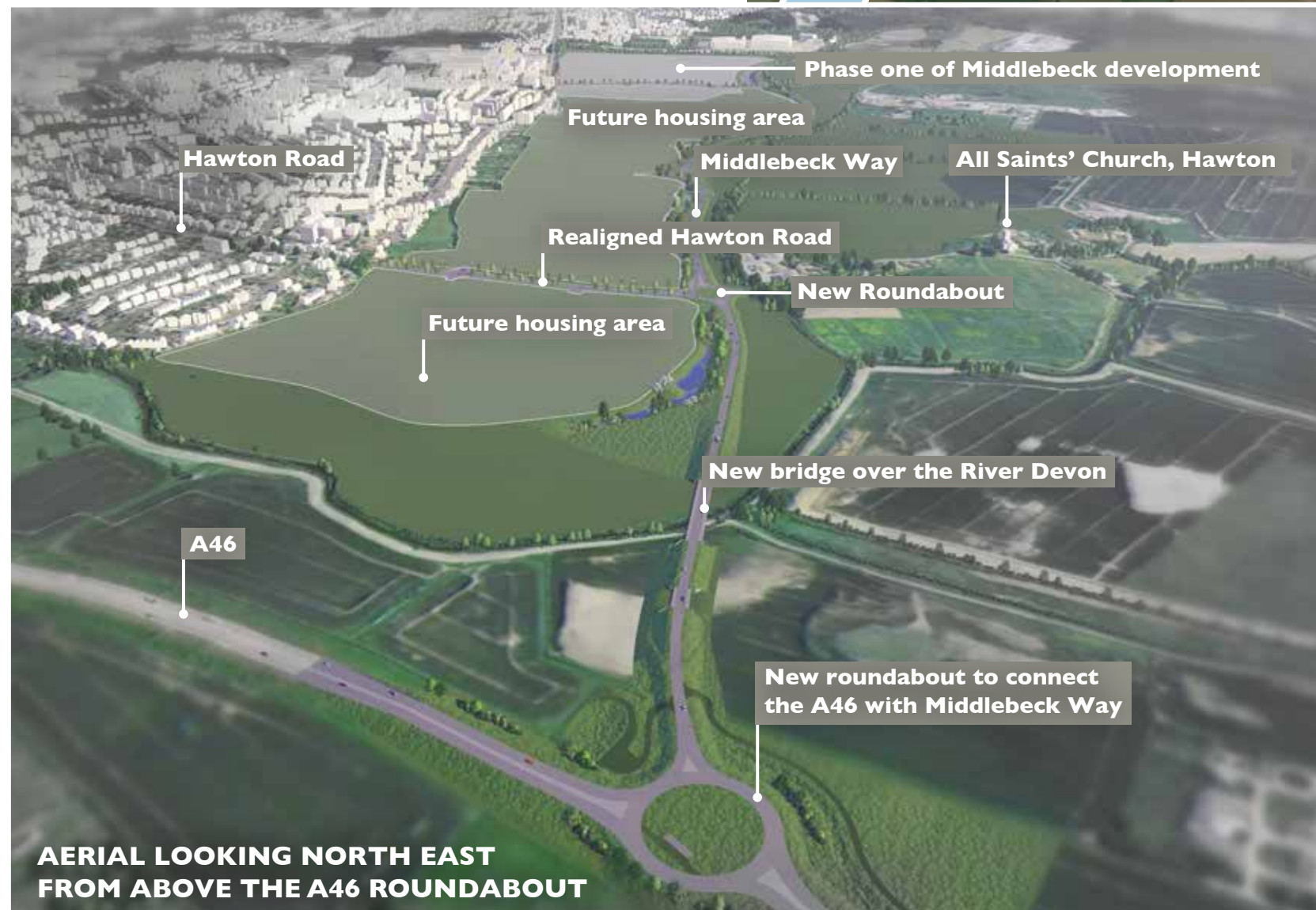
AERIAL LOOKING NORTH EAST FROM ABOVE THE A46 ROUNDABOUT

Staple Lane will be permanently closed to through traffic, where the road is currently closed, with residential access only from its existing junction with London Road. Traffic will instead enter the new Southern Link Road via the new roundabout near Welcome Break Services, as shown below.