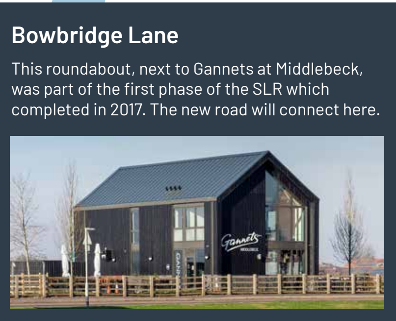
Bowbridge Lane This roundabout, next to Gannets at Middlebeck, was part of the first phase of the SLR which completed in 2017. The new road will connect here.