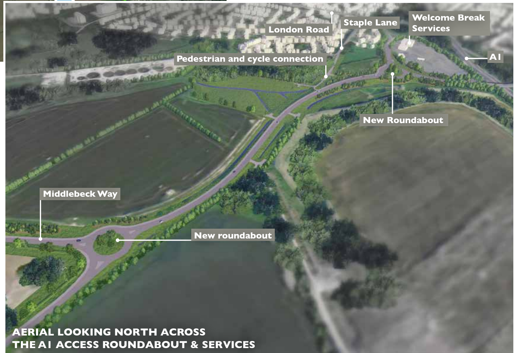
AERIAL LOOKING NORTH ACROSS THE A1 ACCESS ROUNDABOUT & SERVICES

Want to find out more? Visit our SLR dedicated webpage at: www.middlebecknewark.com/southern-link-road